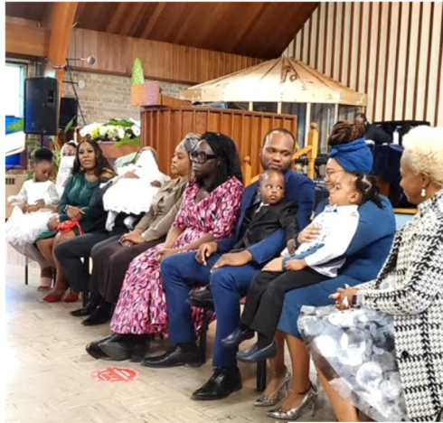
Scarborough baby blessing