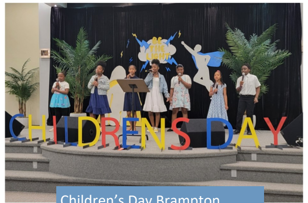
Children's Day Brampton