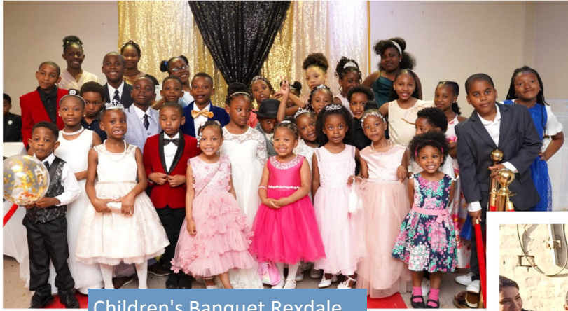
Children's Banquet Rexdale